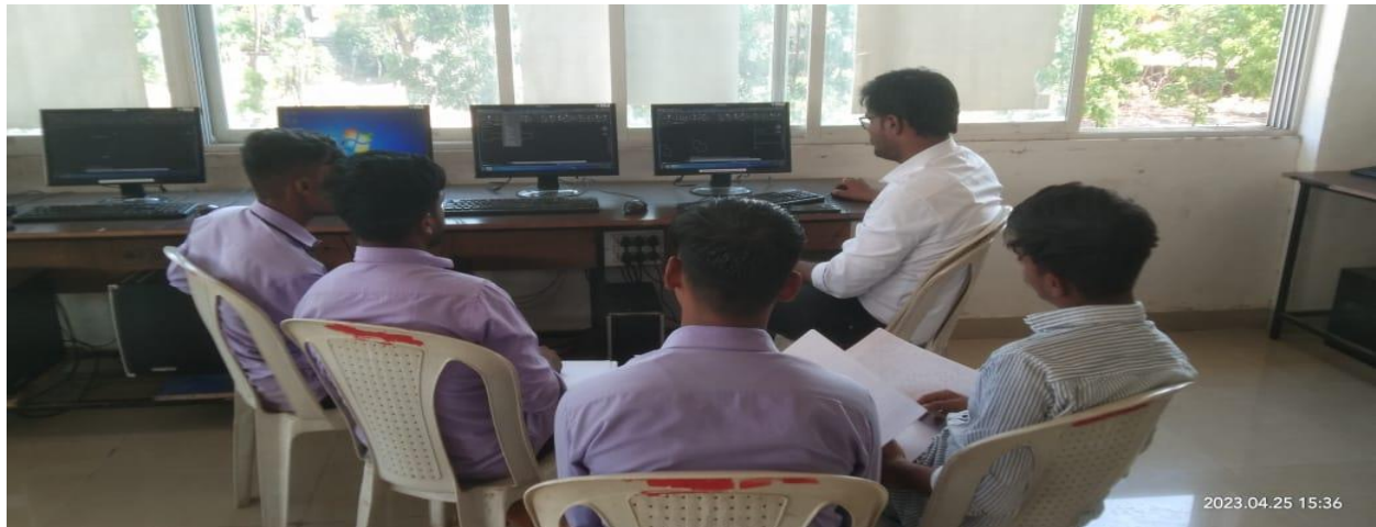
*Add On Course on Auto CAD-Pic 01*